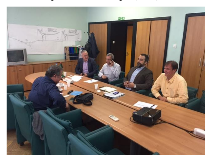
Photo E: Public discussion meeting in PERS Offices in Belgrade, 22 September 2017